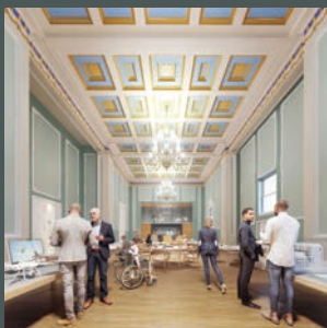
The ballroom as it is now and as it could be